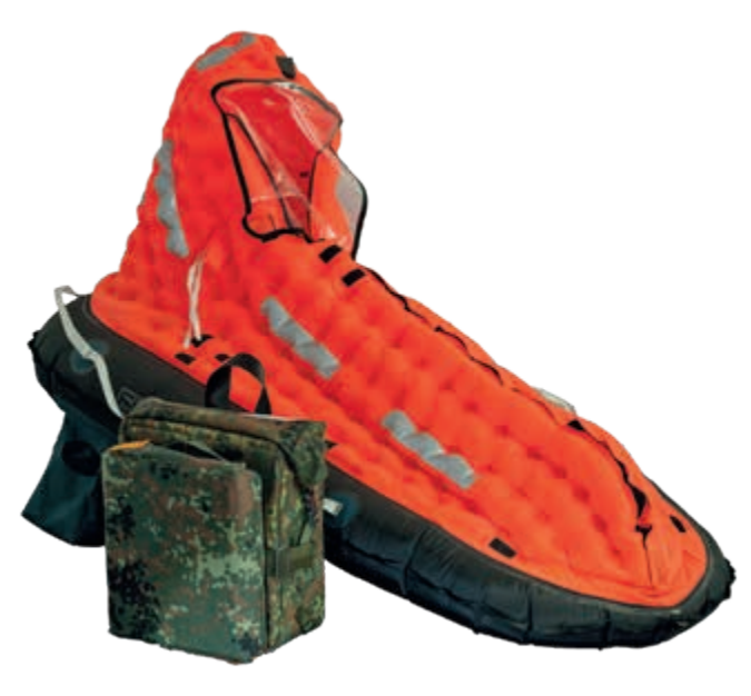
FRS-3 aircrew rescue dinghy and personal survival pack (PSP)